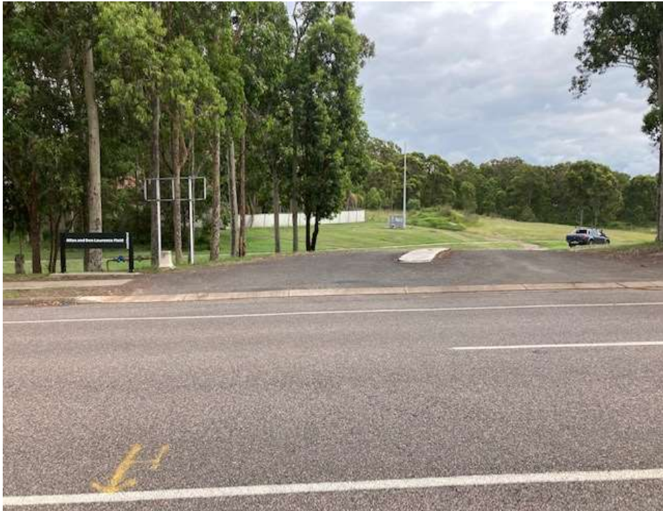
Photo 1: Entry to A & D Lawrence Oval from Thomas Coke Drive, Thornton.

The proposed access road is subject to a previously approved masterplan from Maitland City Council. The RFS had issued General Terms of Approval (GTA) stating that access is to comply with the Planning for Bushfire Protection 2019 guideline, though there is no specific reference to the requirement for a through road. In their assessment of the development application, the RFS have advised that they “would accept no less than a through access to a minimum of a non-perimeter road standard.”